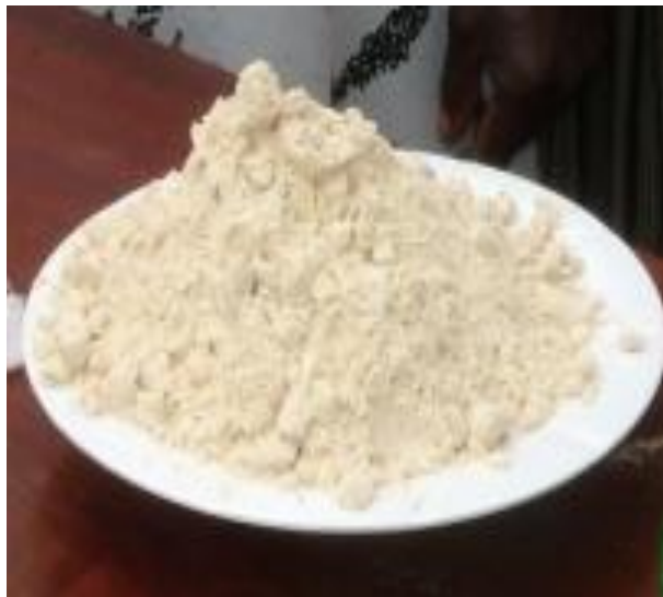
Nutri-Meal is a mixture of different flours.