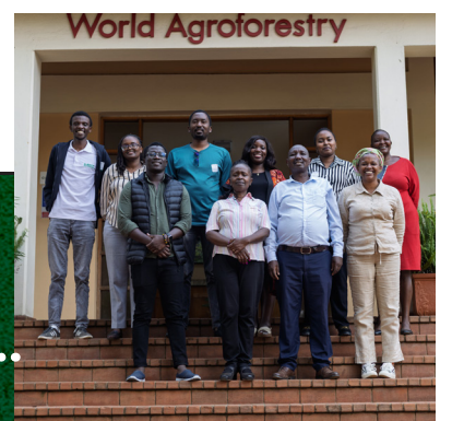
Seed Fair Planning committee members representatives at ICRAF Nairobi.