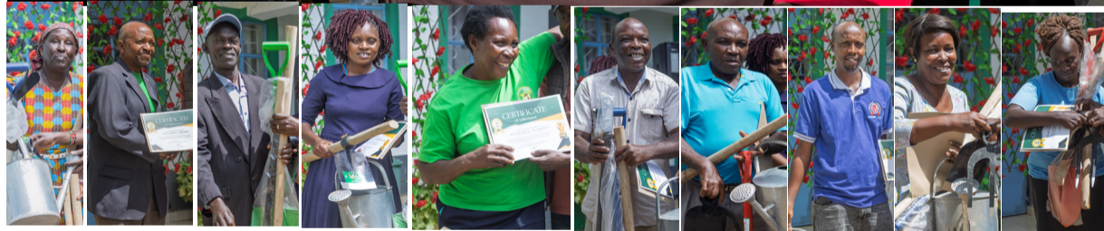
Featured: A photo of the farmers receiving awards.