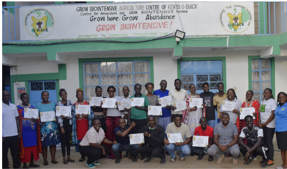
Participants pose with certificates after completing the two-day agroecological farming workshop.

Farmers from Kajiado County gathered for a two-day intensive training workshop at the Grow Biointensive Agriculture Center of Kenya (G-BiACK), aimed at strengthening their knowledge and skills in sustainable agriculture. The workshop, supported by ActionAid, brings together participants to engage in practical learning, knowledge exchange, and discussions on improving farm productivity while conserving the environment.