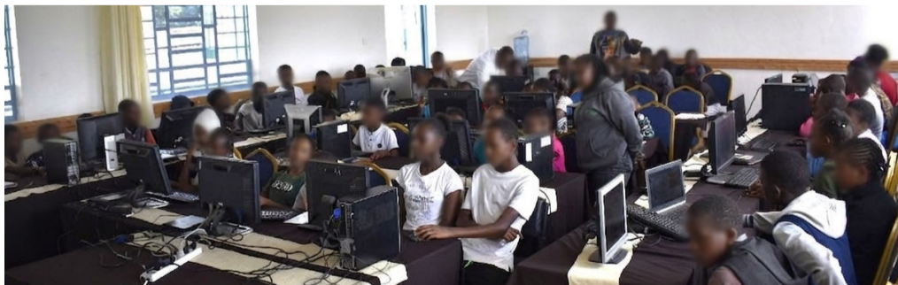
Learners take part in a hands-on computer and coding session.